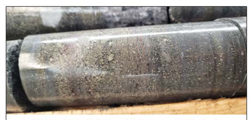
22.3 g/t Au | 0.7 m (254.3 m - 255.0 m) semi-massive "buckshot" pyrite with sphalerite and pyrrhotite