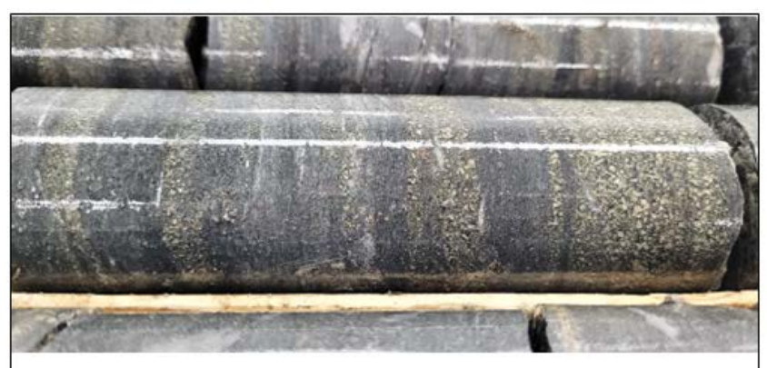
26.3 g/t Au | 0.7 m (258.0 m - 258.7 m) semi-massive "buckshot" pyrite with sphalerite